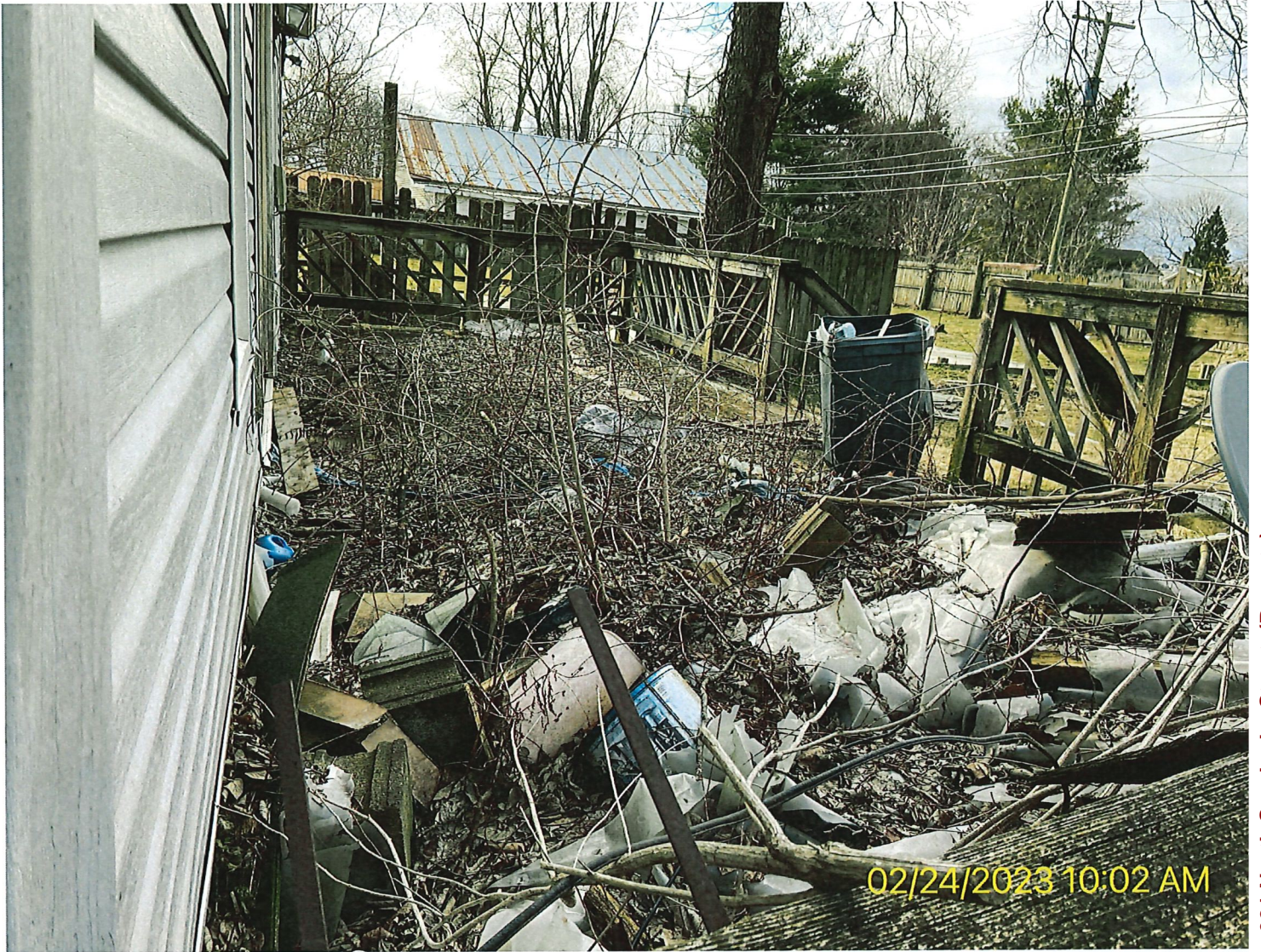
Communication: 621 North Sandusky Street (Reports)