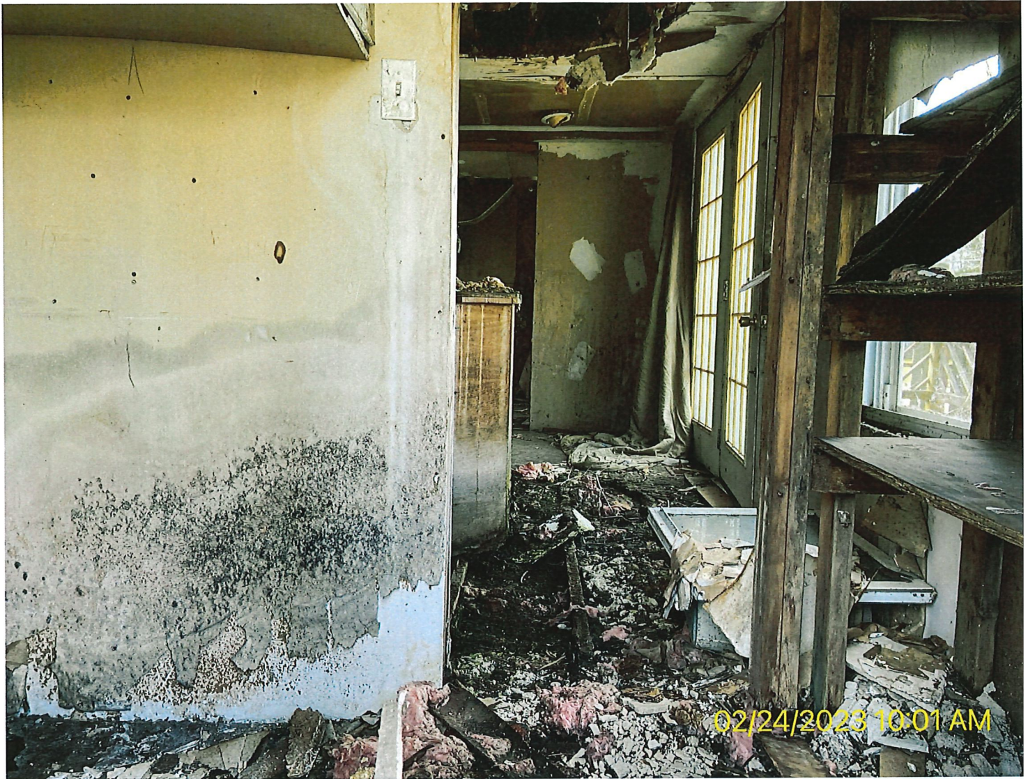
Communication: 621 North Sandusky Street (Reports)