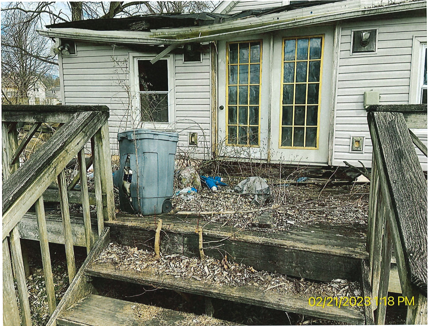
Communication: 621 North Sandusky Street (Reports)